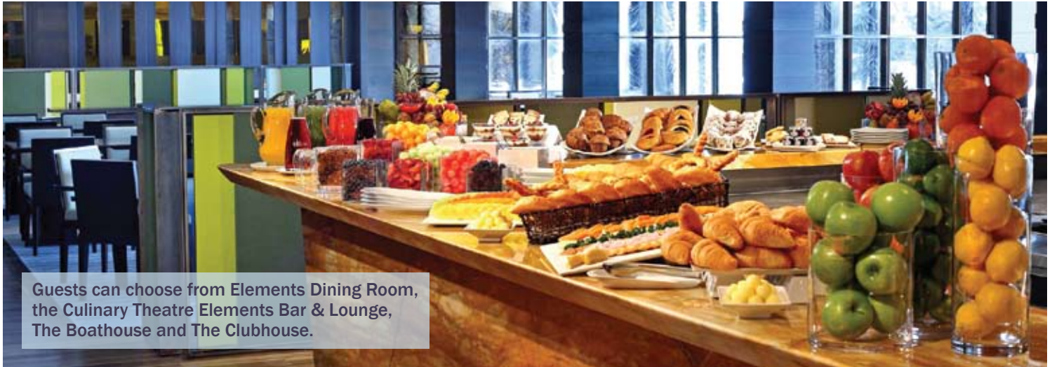
Guests can choose from Elements Dining Room, the Culinary Theatre Elements Bar & Lounge, The Boathouse and The Clubhouse.