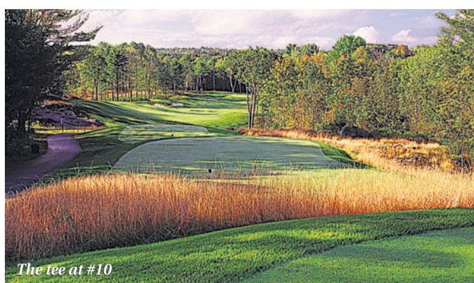
The tee at #10