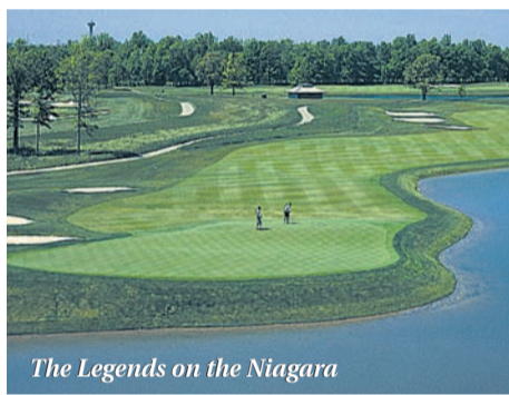
The Legends on the Niagara