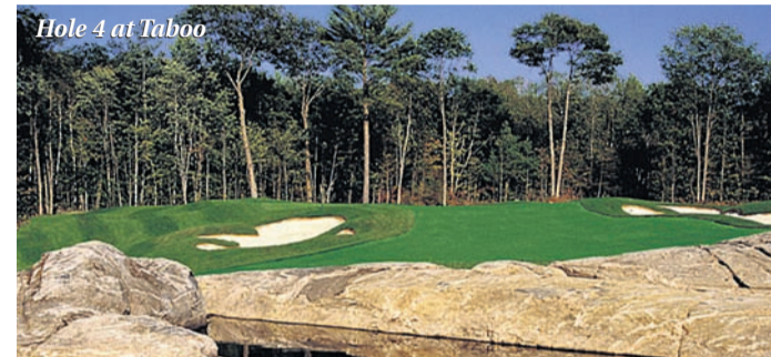
Hole 4 at Taboo

Not only a great player, Mike Weir has excellent taste in golf. www.tabooresort.com